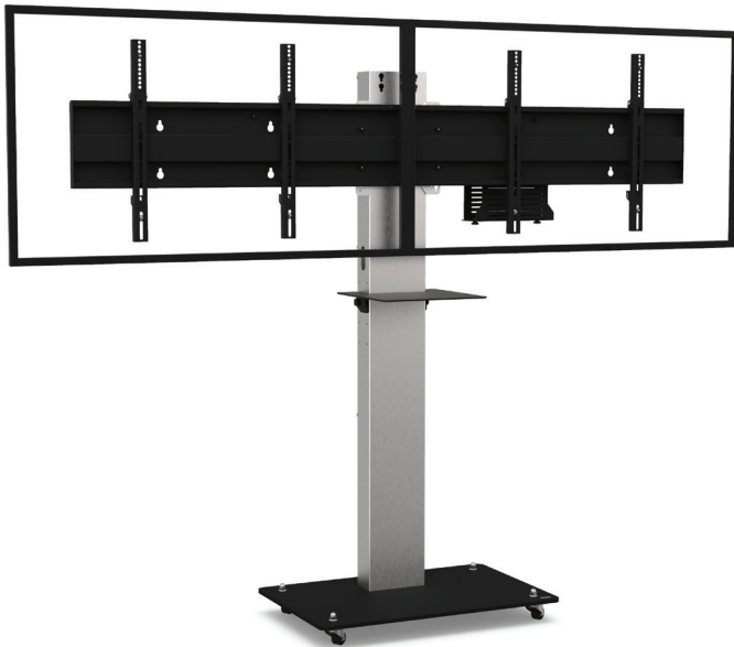
Screens simulation 46"

Part numbers : BOXERD4050VCPACK BOXERD5255VCPACK