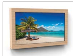
Option : wood finish