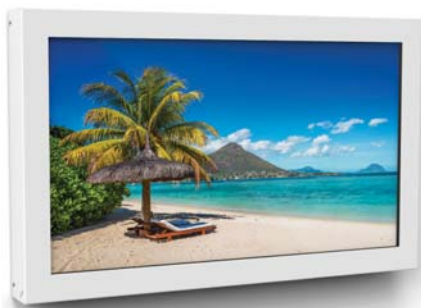
Screen simulation 40"

INDOOR ENCLOSURE is a enclosure for indoor environments. According to the version, this solution is suitable for a screen from 32 to 65 inches.