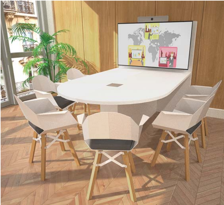
Screen simulation 55"