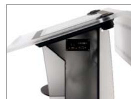
Example of location for connection panel