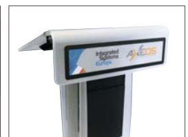
Customisable and magnetic plate for logo