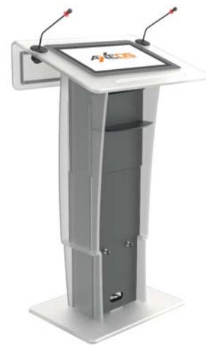
NEONYX TOUCH LIFT