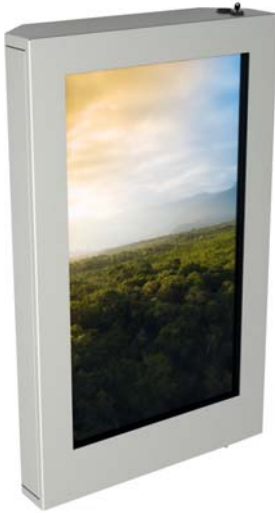
Screen simulation 55"

OUTDOOR ENCLOSURE is a digital signage enclosure for outdoor environments. According to the version, this solution is suitable for a screen from 40 to 65 inches.