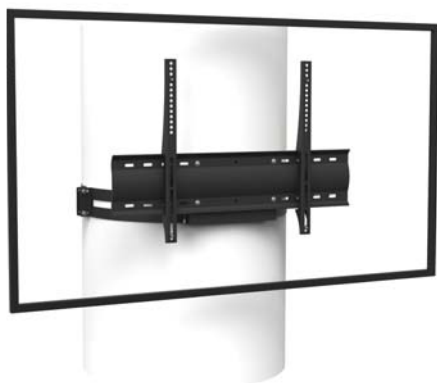
Screen simulation 55"

Pole mount bracket offer a discrete integration of a screen into environment.