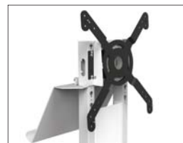
Rotating mounting bracket

Fixed to the wall or fixed on Axeos' stand