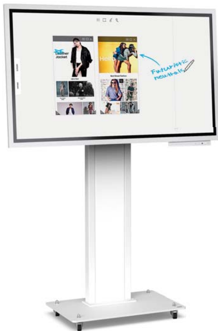
Screen simulation 55"

This mounting bracket is suitable for an interactive screen from 55 to 65 inches, which requires rotation in portrait and landscape mode.