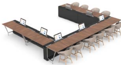
7 interconnected modules