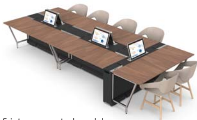
5 interconnected modules