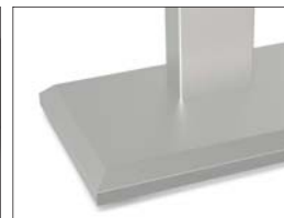
Option : heavy load casters and skirt to cover up