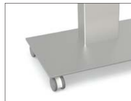
Option : heavy load casters