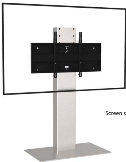
Screen simulation 84"

XENON TOUCH is a stand designed for large touch screens. This stand is suitable for a screen from 55 to 100 inches and up to 150 kg.