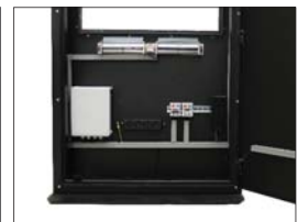
Example of integration of equipment