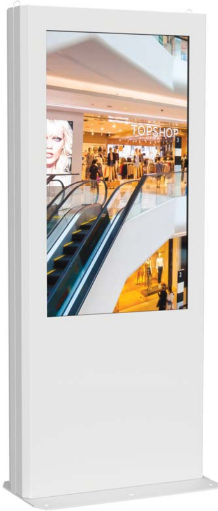
Screen simulation 55"