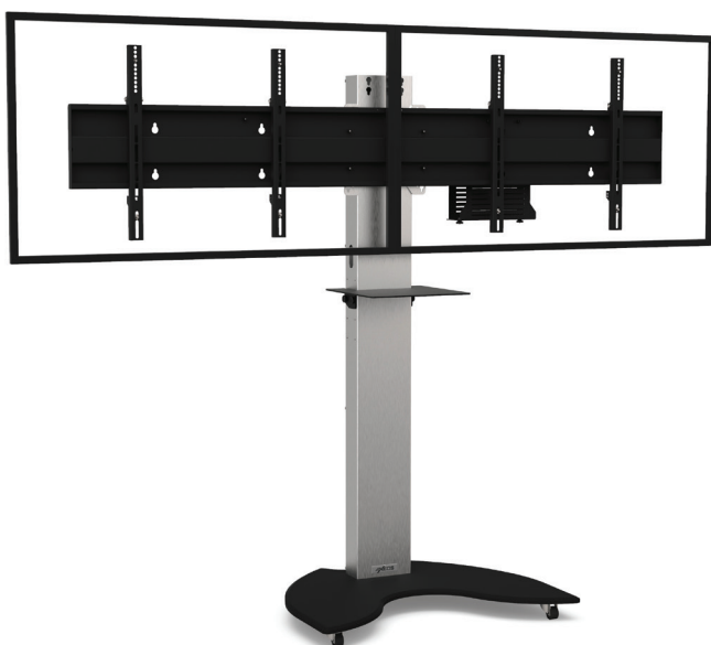
Screens simulation 46"

Part numbers : EASYXD4050VCPACK EASYXD5255VCPACK