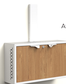
Attached to the wall