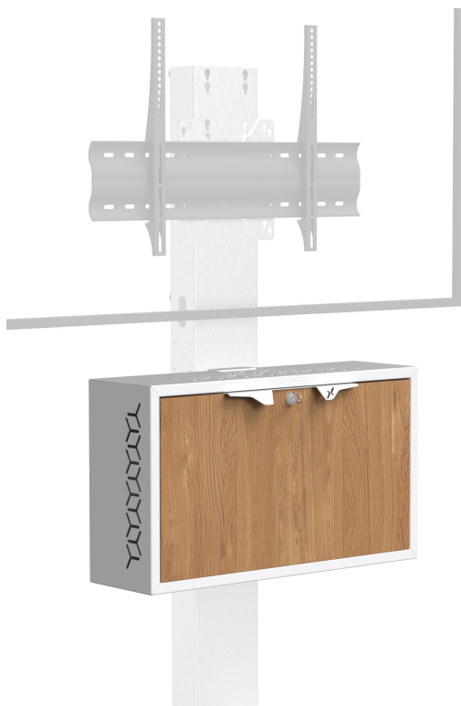
On an Axeos unit