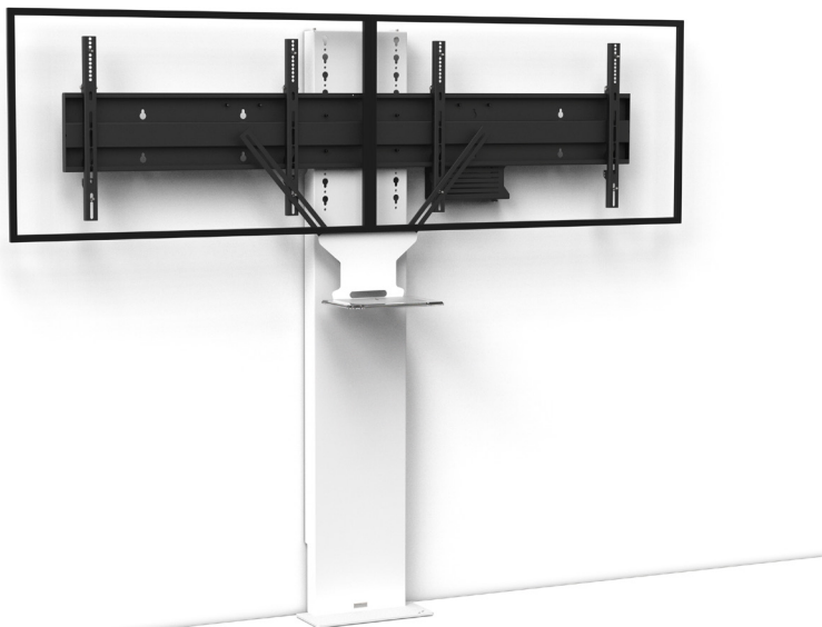
Screens simulation 46"

Part numbers : STILIXD4050VCPACK STILIXD5270VCPACK