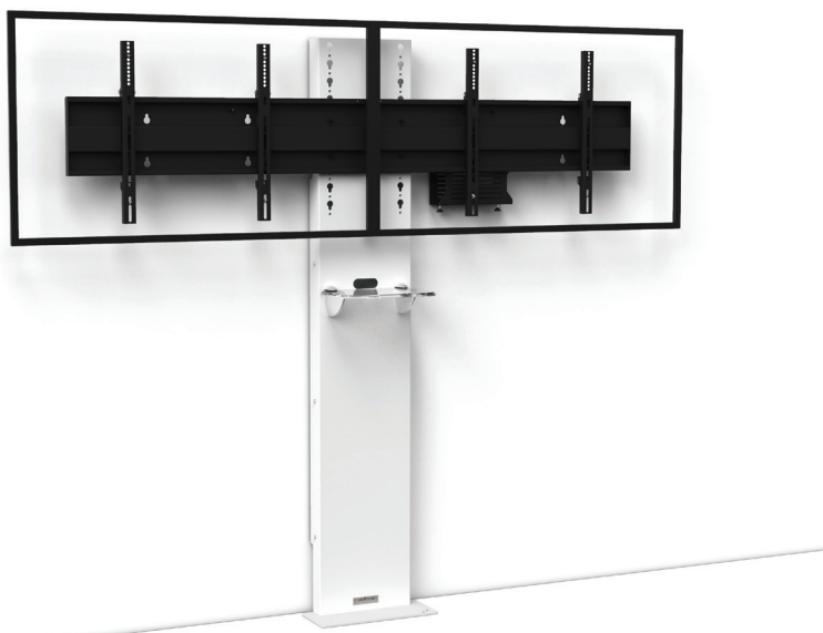
Screens simulation 46"

Part numbers : STILIXD4050VCPACK STILIXD5270VCPACK