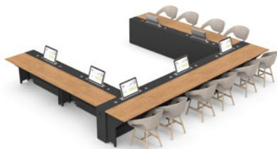
7 interconnected modules