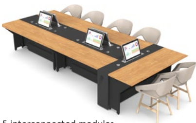
5 interconnected modules