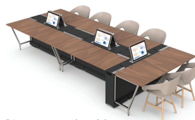
5 interconnected modules