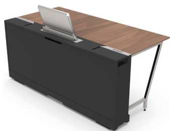
Module suitable for 2 people