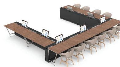
7 interconnected modules